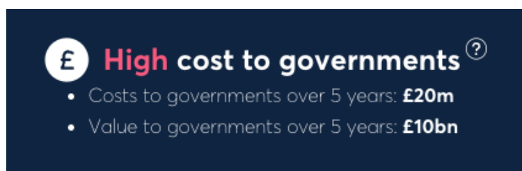
Figure 2. Screenshot of policy cost represented in the toolkit

To calculate this score we commissioned the cost-modelling consultancy HealthLumen to conduct literature reviews to establish the cost to implement each policy. The final score out of five is based on where the policy ranked in terms of cost. The most expensive policies were allocated a score of 'very high', and the least costly a score of 'very low' (and so on). You can find more information about the data sources used to estimate the costs in HealthLumen's report, on the Methods page of the Blueprint for Halving Obesity toolkit.