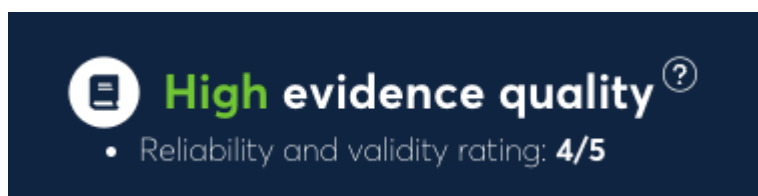
Figure 3. Screenshot of the SoE for each policy represented in the toolkit

To assign scores, an SoE scale was created that assessed reliability and validity of evidence. Existing scales were not used as real-world implementation of interventions was valued on a similar level with trials and lab-based research. Policies were scored on a scale from 1-5 (no evidence, to very strong evidence).